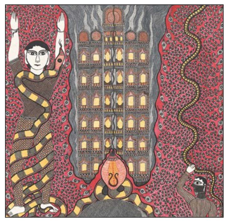
Mumbai's Taj Hotel in Flames