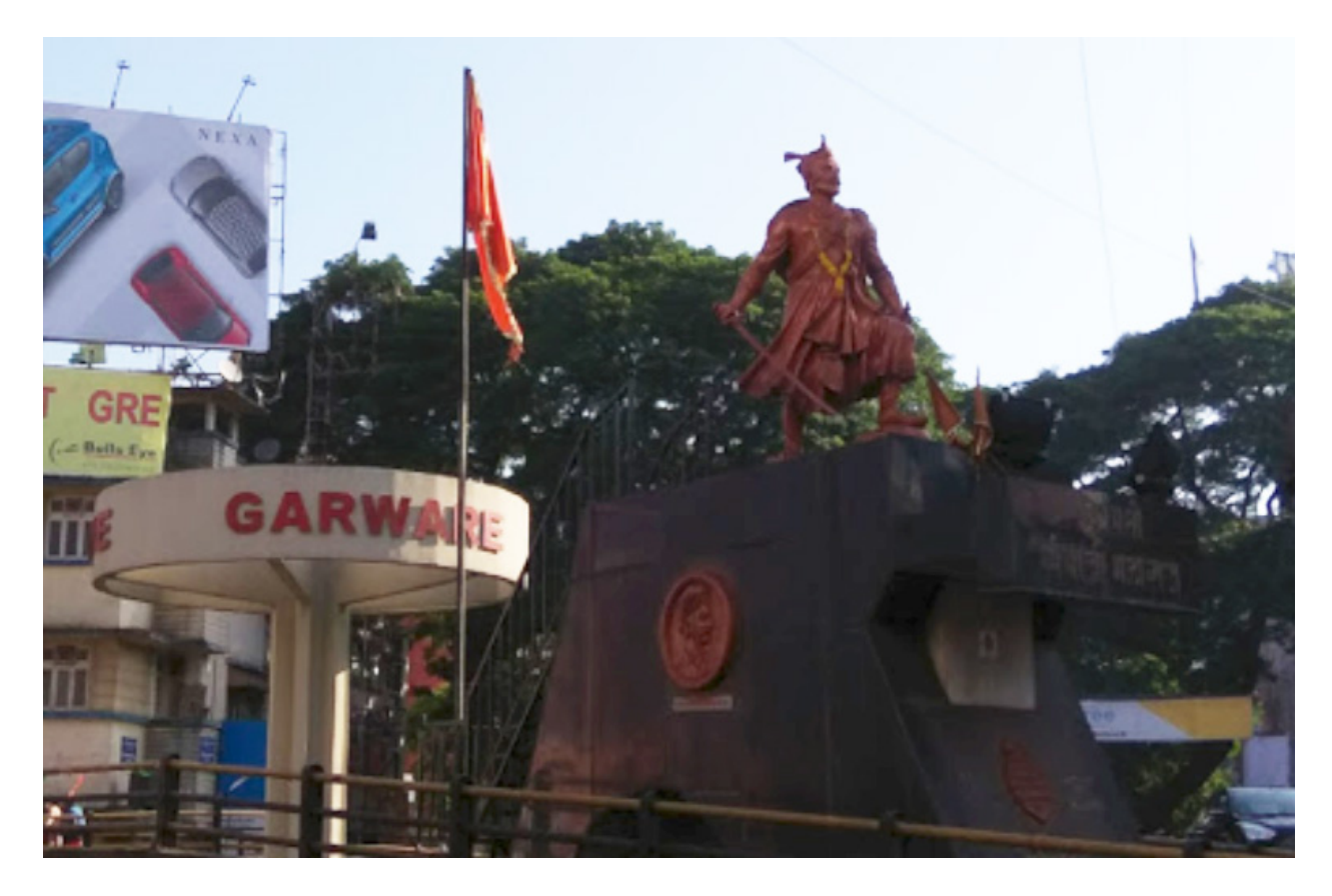
Figure 2.1 Statue of Chatrapati Sambhaji Maharaj in a central area of the city. Sambhaji Maharaj was the son of the Maratha icon Shivaji, and is also revered as a courageous fighter in the history of 18th century Maharashtra. Note his aggressive stance, stepping forward, head held high, with a sword in his right hand.