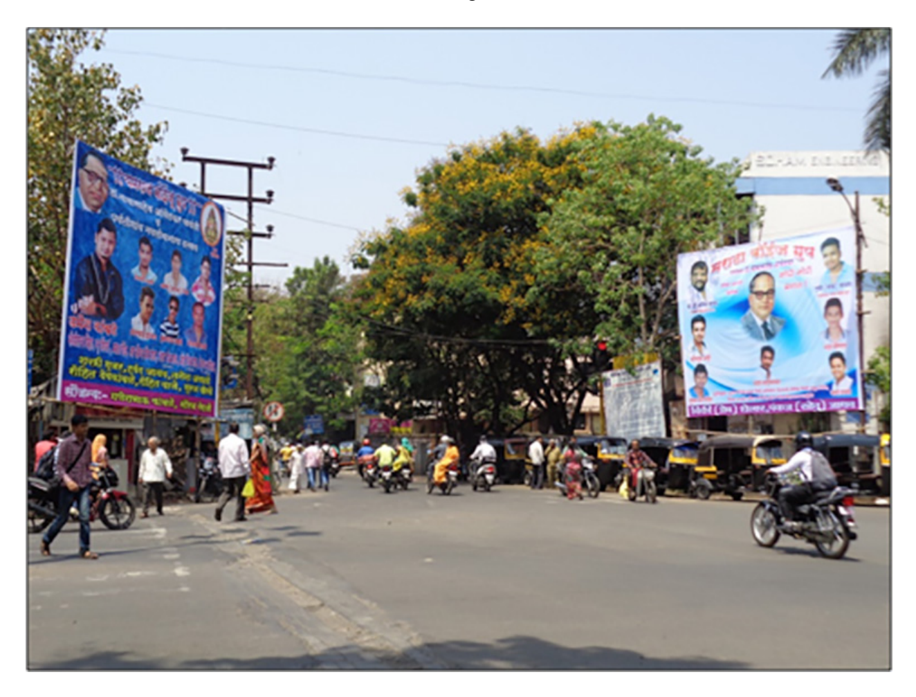
Figure 2.4 Flex boards put up to mark the birthday of India's foremost Dalit leader and maker of the Constitution, Dr. Babasaheb Ambedkar.

neighborhood of the Shellar galli, it was clear that several important resources – such as licenses for food vending carts, permission for extra water supply lines, and contracts for managing parking lots and several such " kaam " (tasks) – could only be achieved through informal contacts with the local municipal councillors or through maneuvering lower level council bureaucracy. Against this background, we can appreciate how central a name's weight can be to get any kaam done; naam , (name) condenses within it not just clout, but the power of networks and the ability to maneuver these expertly for one's own benefit. Moreover, it is the masculine forms of sociality and mobility that make possible the ability to construct, sustain and nurture these informal ties and networks in the Indian context, thus making informality a highly masculinized terrain.<sup>44</sup> The ability to "get things done" through just the mention of one's name thus becomes an index of one's degree of manliness, specific to the urban poor and working-class sections, as reflected in the flex dedicated to the wrestler in Figure 2.5.