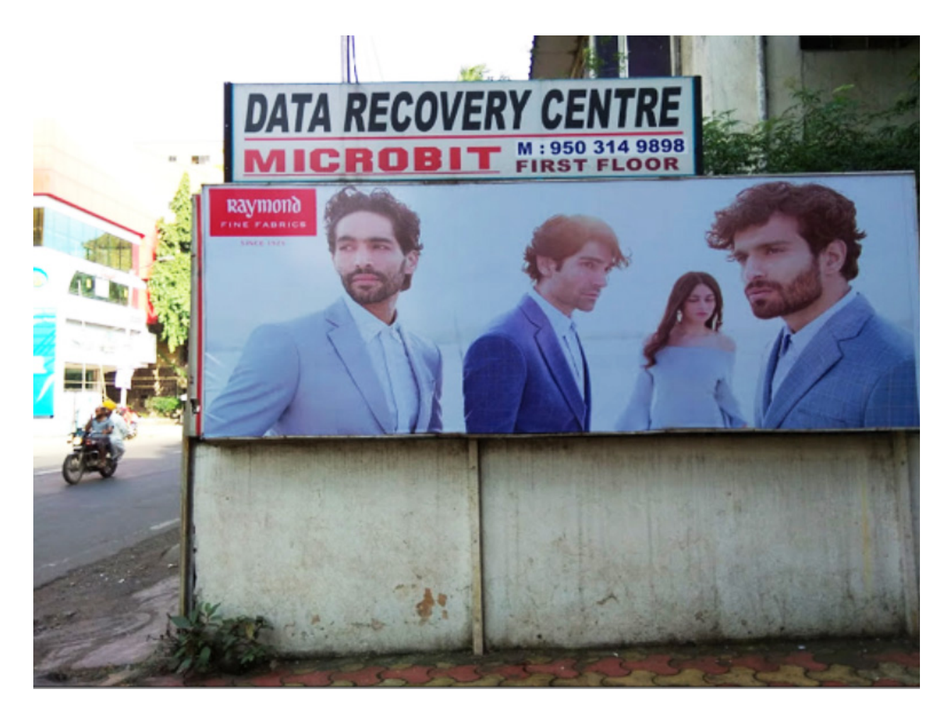
Figure 1.4 A flex board advertising a men's clothing store along the street