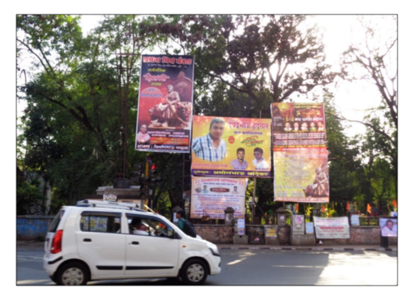
Figure 2.3 Flex boards crowd a prominent traffic junction, marking the birthday of Shivaji, an extremely popular Maratha warrior icon of the state.