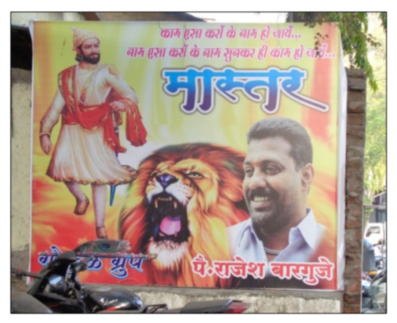
Figure 2.5 Flex board paying tribute to a local leader on Shivaji's birthday.

inclusion of his nickname, "Yoyo," signals his resemblance to the extremely popular Punjabi singer Yo Yo Honey Singh. His dark leather jacket, the thick chain displayed prominently around his neck, the stone stud earring in his right ear and his sideburns are all deployed to further emphasize the similarity between this young man and the popular singer. These accessories also signal a certain flamboyance of style and a familiarity with the latest trends in the world of fashion. Figures 2.7 and 2.8 also illustrate a characteristic style of bodily presentation and style in the flex boards: the wearing of a heavy gold chain against a dark shirt. The vermillion mark on the forehead is also a prominent marker of a traditional masculine comportment in the context of Maharashtra. Both the young men in above images also have accessories like a tattoo or an earring, as well as slickly gelled hair.