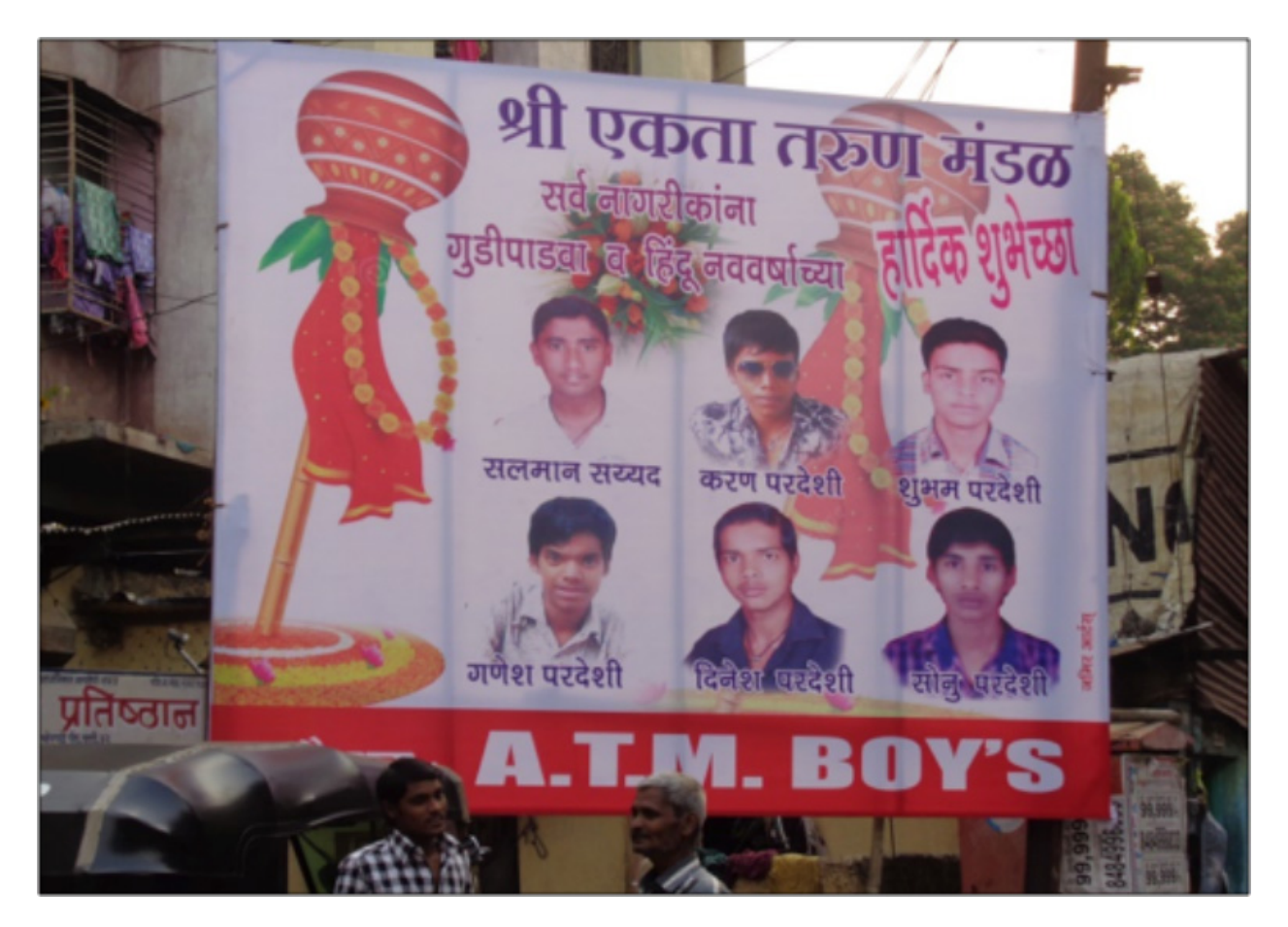
Figure 2.9 "ATM Boys" is an acronym for Ekta Tarun Mandal, a youth collective, on a flex put up for Hindu new year.

narrative of consumption in turn serves to reconfigure the idiom of consumption itself, which is increasingly cast in a class-specific and caste-specific imaginary. It is these highly localized imaginaries of consumption which continue to consolidate on the flex boards in Indian cities today.