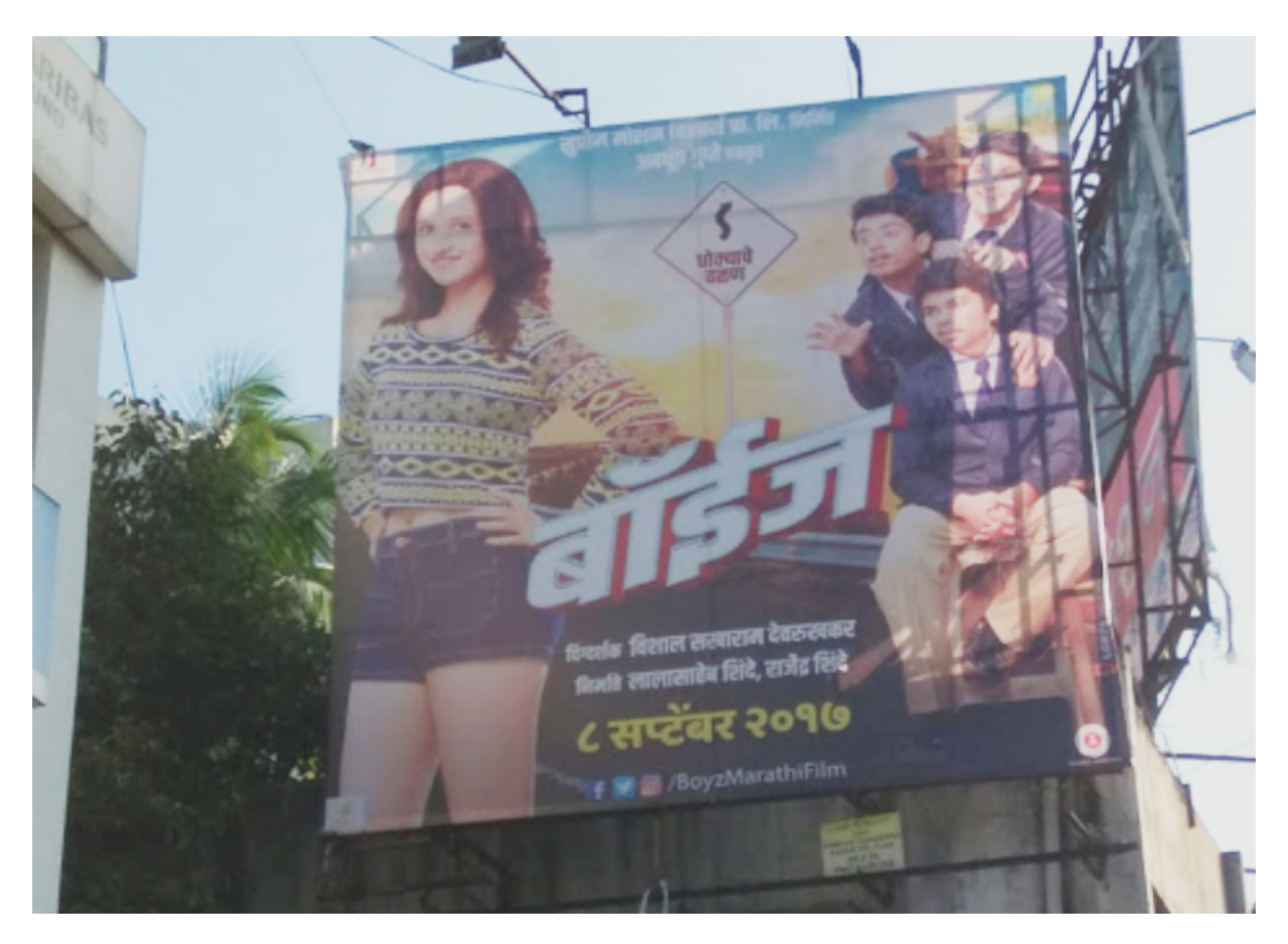
Figure 2.2 A poster advertising a Marathi film entitled "Boys," in which three high school boys (right) peer eagerly at a seductive girl, in what promises to be a sex comedy.