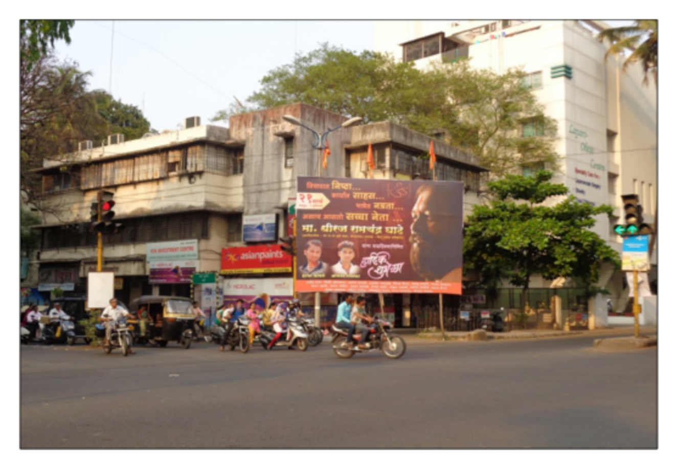
Figure 2.14 The busy street crossing where flex boards featuring Ghate are regularly erected.

Kapde, boot, khanya paasun " (He looks after "his boys" completely, right from their clothes and shoes to their meals).