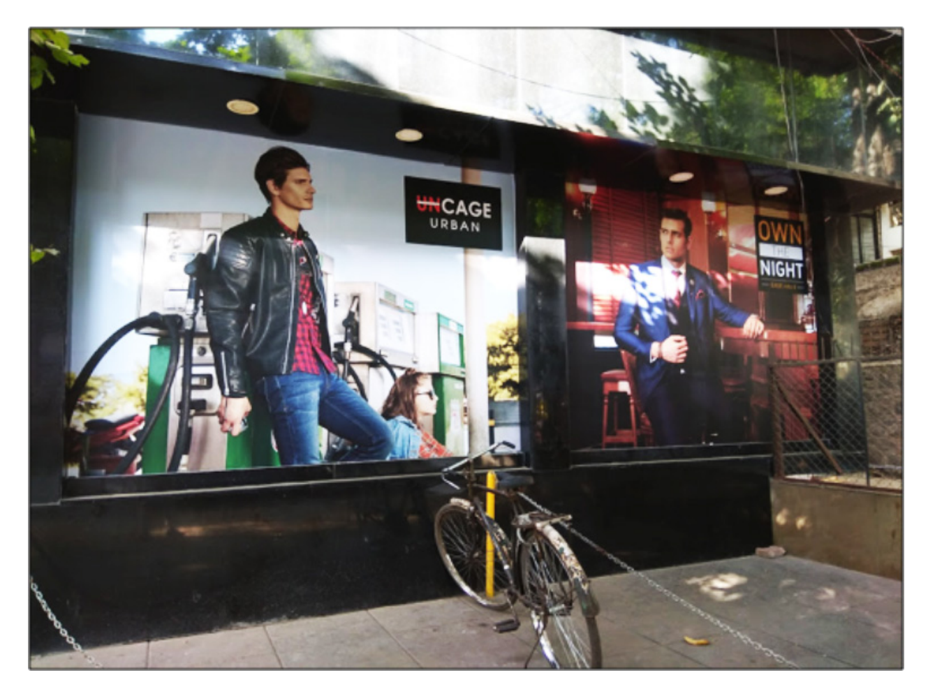
Figure 1.5 Images outside a high-end clothing store for men in an upmarket area in Pune