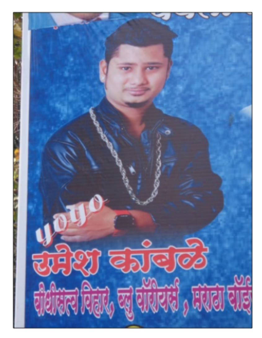
Figure 2.6 Flex boards as sites of bodily presentation.

sound/look Anglicized. At the same time, these names are also heavily gendered in their framing, referring to masculine qualities of courage on the one hand and of a carefree, youthful "boys will be boys" idiom on the other.