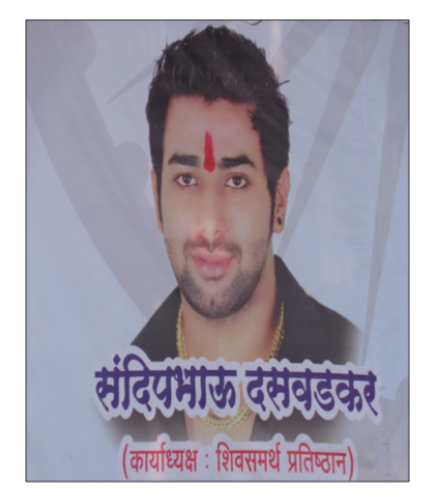
Figure 2.8 Another image from the same flex as 2.7.

starkly different from the idiom that is flashed across urban India today, via its glitzy malls, upmarket restaurants, foreign branded stores and high-end accessories and set apart from the kind of consumption that manifested in the advertisements specified in the preceding section.