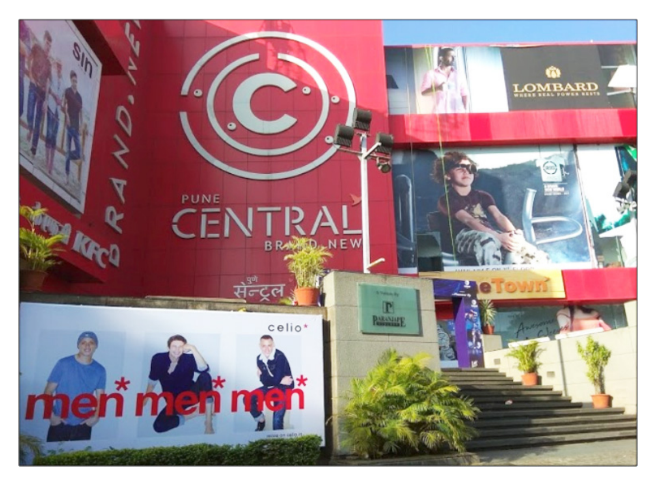
Figure 1.3 Entrance to a mall in Pune, where a variety of men's accessory and clothing brands are advertised

In the more than two decades since India liberalized its economy in 1991, Indian cities (big and small) have undergone fundamental spatial and social reconfiguration which is pegged onto class, gender and caste differences. A major highlight of this transformation has been the recasting of the notion of "public" in the exclusive image of the urban, middle-class consumercitizen in globalizing India.<sup>18</sup> This revised image is manifested in the realm of the public in its spatial and social manifestation. Thus contests over existing urban spaces have sharpened acutely<sup>19</sup> as public space has become increasingly privatized via the mushrooming of exclusive consumer spaces, malls, multiplexes and gated communities.<sup>20</sup> A new brand of middle-class civic activism is asserting its presence in the governance and management of urban public life, edging out the imagination of an inclusive city via its subscription to neoliberal notions of efficiency, "world-class"- ness and most recently "smart cities,"<sup>21</sup> which views the presence of urban poor as nuisances<sup>22</sup> or as hostile bodies.<sup>23</sup>