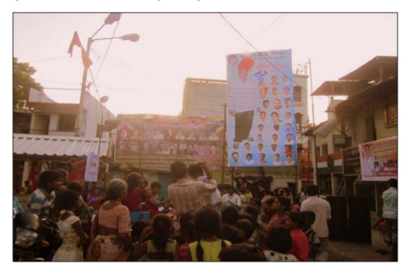
Figure 1.2 A crowd gathers for the celebration of Mohanlal's birthday in Shelar galli, Pune

This paper is based upon my extensive documentation of flex boards between the years 2014 - 2016 in the city of Pune. I turn an analytical lens on the practice of erecting flex boards in the city to illustrate how these boards serve as a site for young, subaltern men to imagine and perform a gendered self. This practice has crucial implications for the increasing class- and caste-based disparity situated in contemporary Indian cities. In this paper I demonstrate that the practice of erecting flex boards also signifies an attempt by the city's subaltern (men) to (re)write themselves into the city's public spaces and the city's public life, thus challenging their gradual marginalization from the former. The landscape of flex boards, I argue, makes available to us a peculiar iconography of contemporary urban masculinity, constituted by an alignment of class-specific motifs of manliness, consumption and politics in urban India.