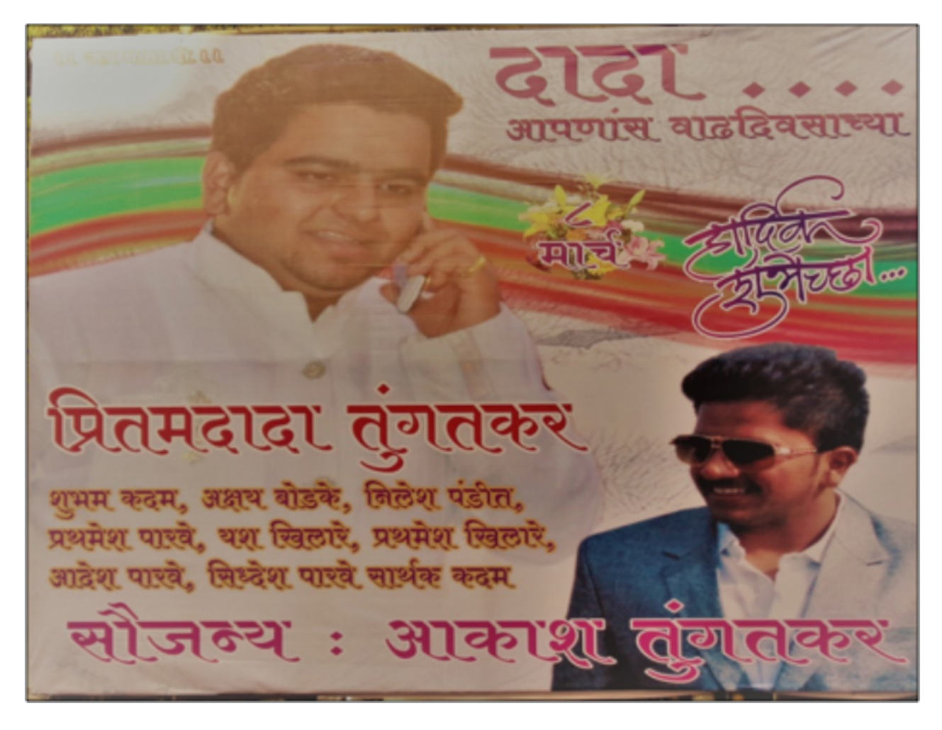
Figure 2.10 A flex erected by a young man (lower R) to honor his mentor (upper L), "Dada" (elder brother) on the latter's birthday. Note the presence of a cellphone and sunglasses, both of which are popular on flex boards.

in urban India, wherein the acutely masculine terrain of the domain of politics, coupled with vulnerabilities of subaltern men, has given rise to a remarkable constellation of politics, class and masculine identity across contexts within the country. Presented below are instances of local political leaders in Pune who enjoy almost a cult following, a large part of it being their distinct style and their excessive consumption (Figures 2.11- 2.13). While reading the valence of these representations of these male politician figures, I find it helpful to re-visit some conversations during my doctoral field research in 2011 and given that these conversations make available to us an added layer of comprehension of these figures, in terms of young, low caste men's own affective engagement with these representations of the political leaders.<sup>57</sup> In the light of the fact that these political figures have continued to dominate the terrain of local politics in Pune for the past decade, these conversations hold significant relevance for the purpose of this paper.<sup>58</sup>