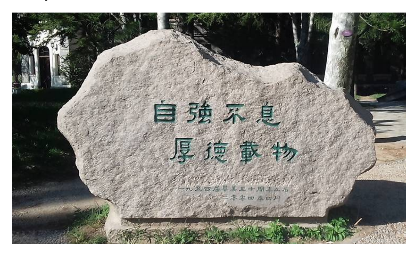
Figure 1: Tsinghua University Motto. Derived from the Book of Change's description of a junzi , the Tsinghua University motto is "自强不息 厚德载物" (Self-Discipline and Social Commitment).

into English as "Self-Discipline and Social Commitment." In 1917 the abbreviated phrases were engraved in large characters on a school crest set into the stage in the main assembly hall as an encouragement to students.<sup>3</sup>