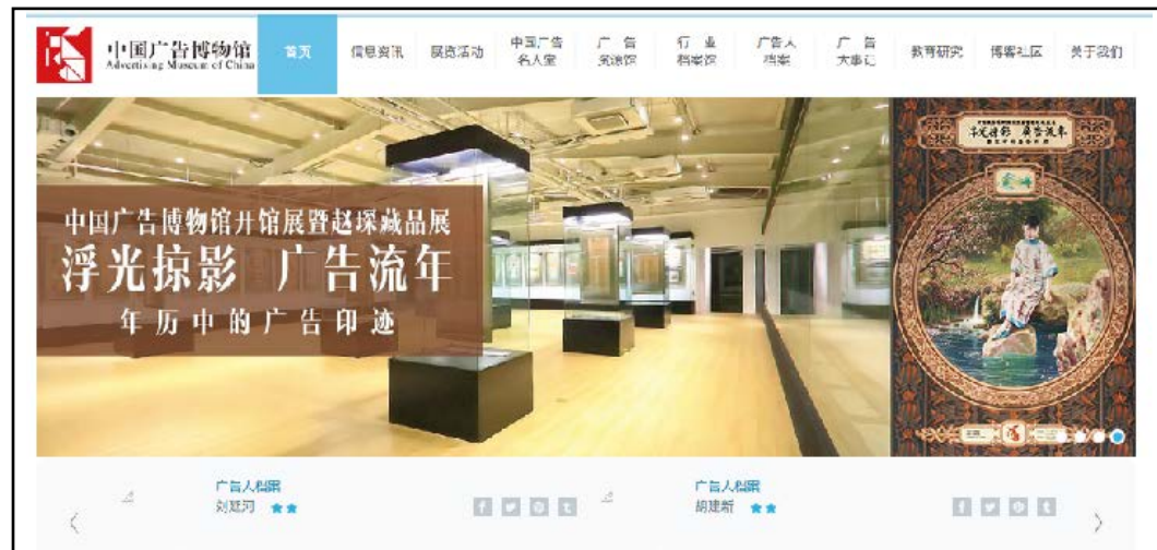
Figure 9. Main page of website for Advertising Museum of China

This is a website of a Chinese advertisement museum, the Advertising Museum of China, founded in 2000 in Shenyang by Zhao Chen, a professor in the Art School at Northwestern University. This museum's collection includes more than 5,000 items, printed advertisements, wooden advertising signs 5 and research documents. Some samples of the printed ads and photos of wood advertisements are displayed on the website as well as brief introductions to Chinese advertising history and significant individuals involved in the advertising industry.