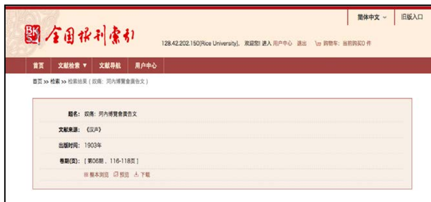
Figure 4. Item of “開幕廣告” having a request link